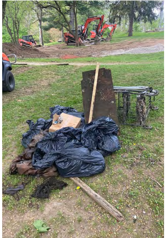
Glenolden Park Cleanup

The weekends of April 15th and 22nd make it clear that, while there may be less trash in some areas, the desire to clean up